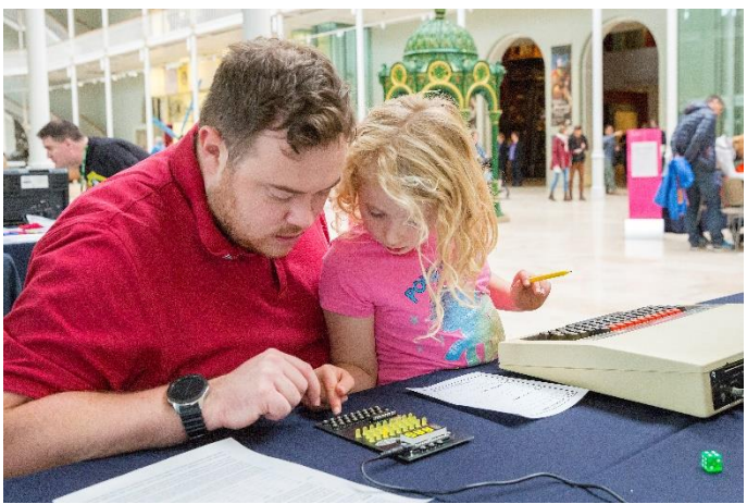
Family engage with enigma board at National Museum of Scotland

Maths Week Scotland offers the perfect opportunity for parents, grandparents and carers to engage with maths with children, both through school and public events.