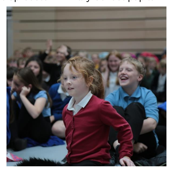
Pupils in Dumfries and Galloway enjoy Bubbly Maths

Maths Week Scotland combined creativity and maths in a range of contexts. Science Ceilidh created three new resource packs using dance and music to explore data collection, symmetry and fractions. In East Renfrewshire, Woodfarm High School created a giant Sierpinski Pyramid out of 1024 cards. As well as the creation of the final structure, pupils prepared by calculating nets of 3-D shapes, powers of 2 and the dimensions of the pyramid. The pyramid proved a popular selfie spot for visitors and pupils in the entrance of the school! Cedarbank School invited pupils from additional support needs