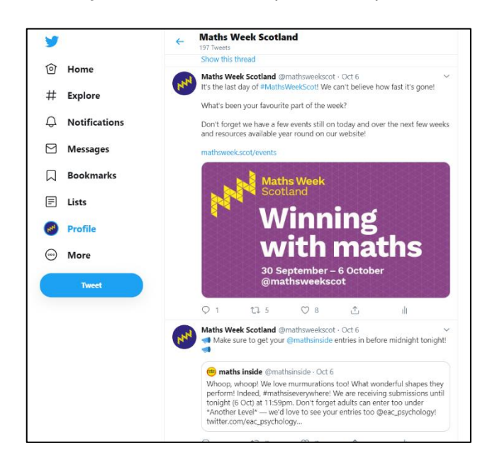
People shared their celebrations on social media

Launched in April 2019, the new branding and website made its Maths Week Scotland debut this year.