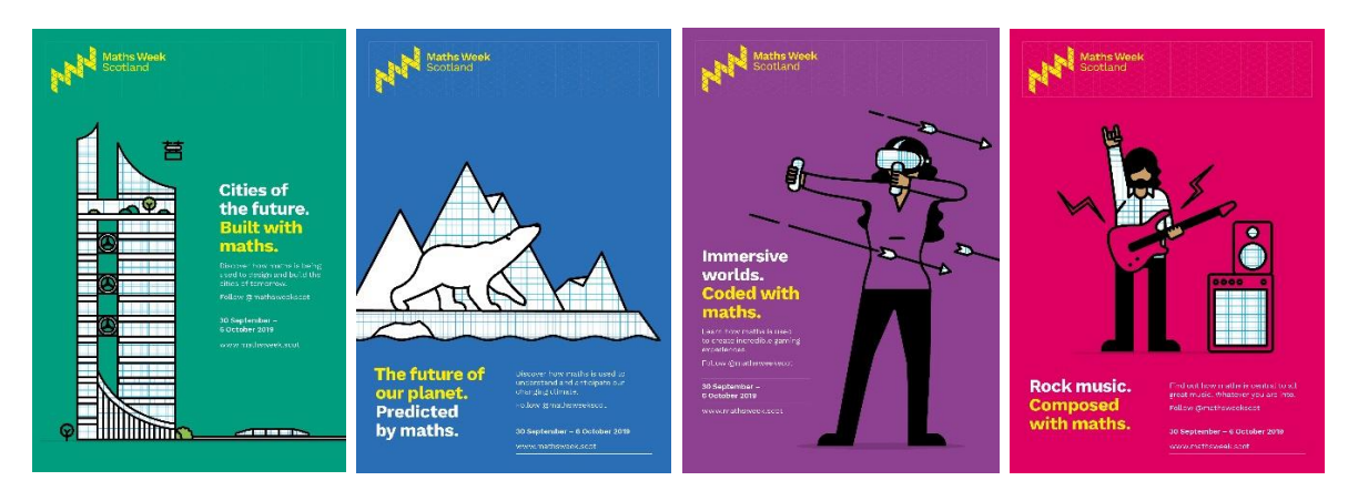
Selection of Maths Week Scotland promotional posters

These training sessions are planned for more locations throughout 2020. STEM Ambassadors supported Maths Week Scotland school and public activities and will continue to do so year-round.