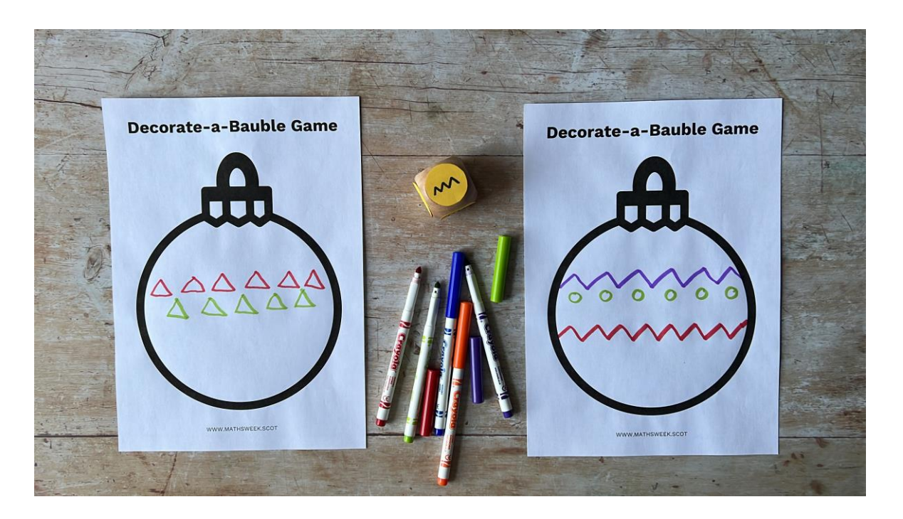
Step 3: The children/ players take it in turn to roll the die and add the shape or pattern they have rolled to their bauble. For an added challenge, you could try creating repeating or symmetrical patterns.