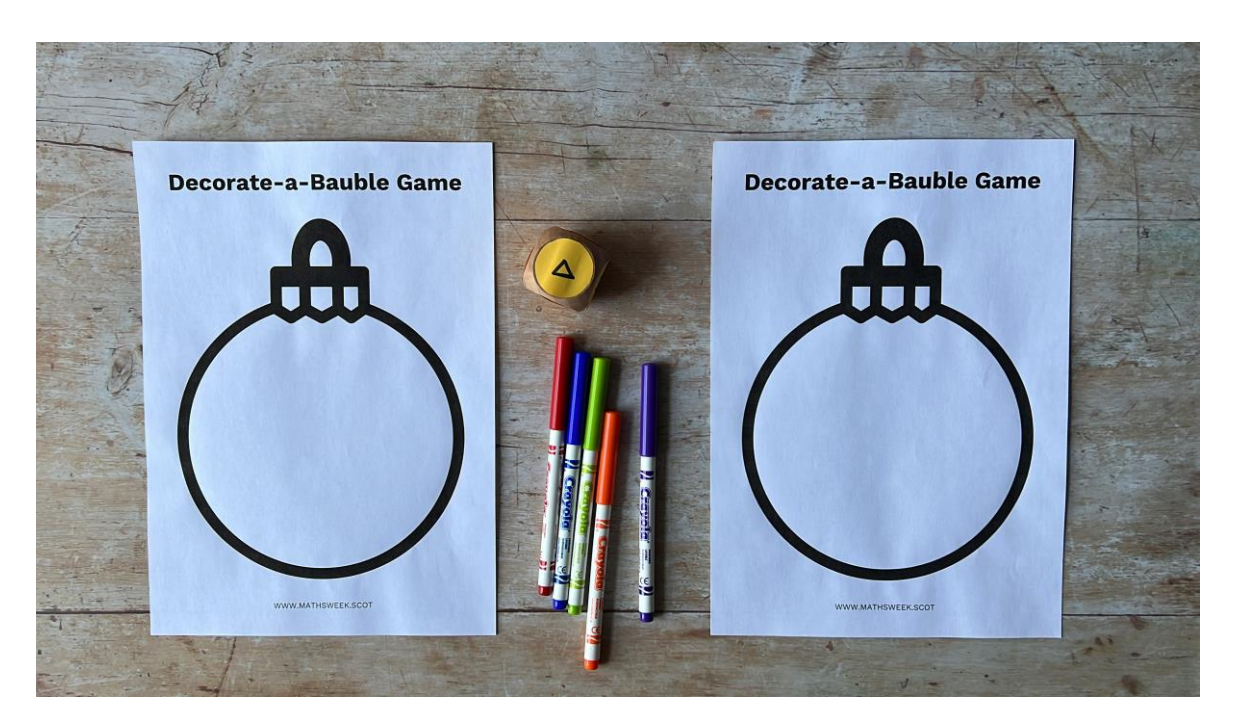
Step 1: Download the Bauble template from our website and print off one copy per child/ player.

In this non-competitive drawing game, children can explore shapes and patterns.